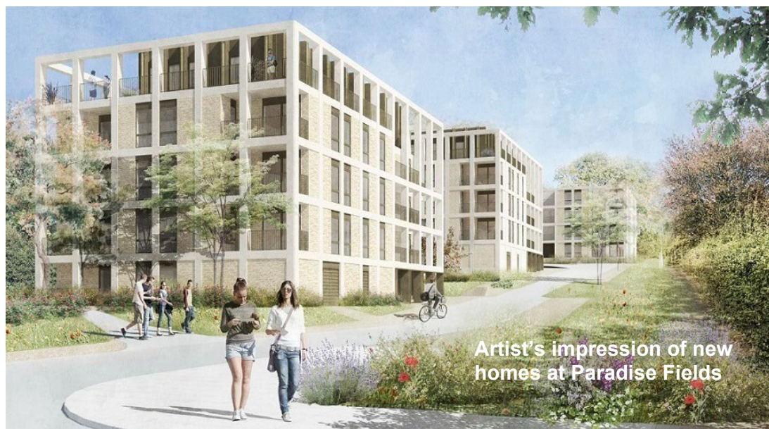
Artist's impression of new homes at Paradise Fields

In spring 2023, we will launch a brand new 'Investment & Delivery Team', aiming to deliver the Council's aspirations to work in partnership with other providers and maximise use of previously-developed land to build the truly affordable housing that local residents need.