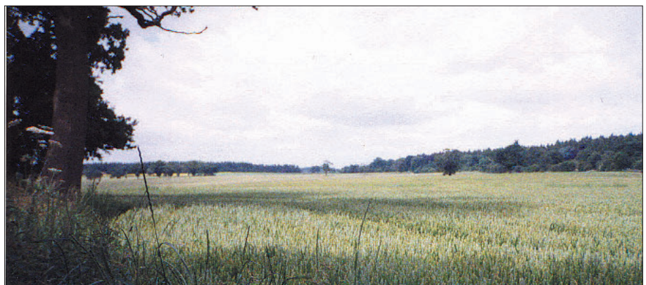
Wooded farmland from • Bedmond Lane