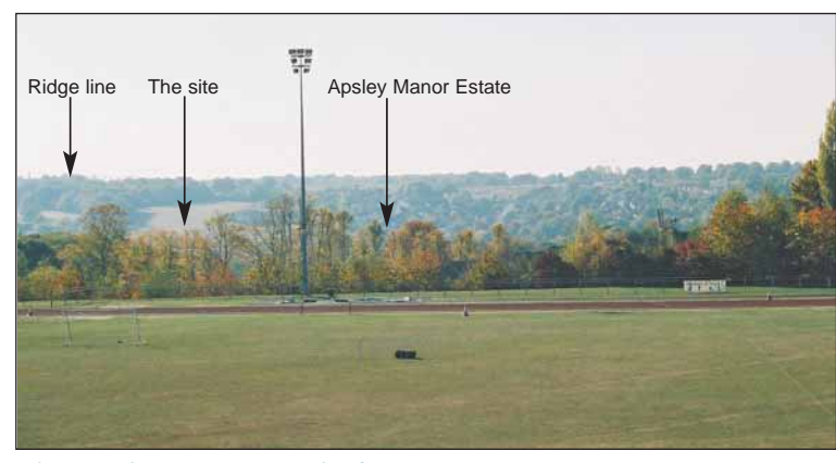
View looking towards the site from Jarmans Park

This analysis identifies the constraints and opportunities provided by the range of slopes incorporated on the site. The gradients of the slopes have been broken down into five categories, (See Appendix II for full description).