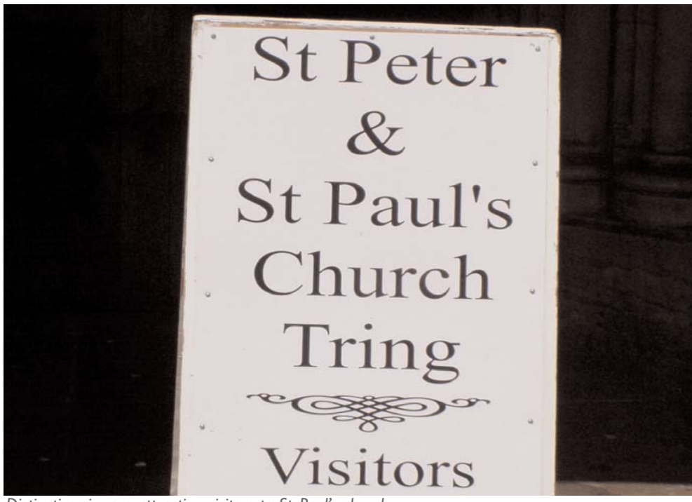
Distinctive signage attracting visitors to St. Paul's church