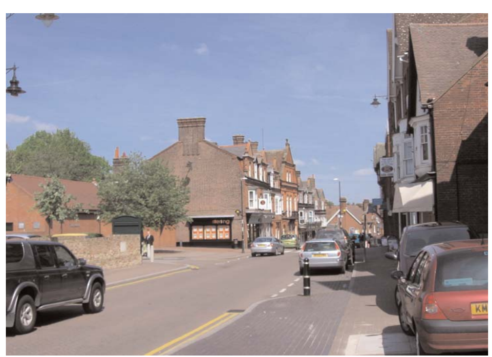
There are few opportunities for on street parking in the High Street.

Commuter parking in the town centre negatively affects the town centre.