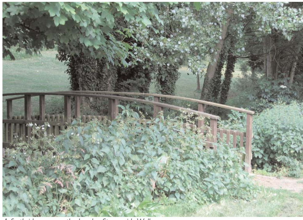
A footbridge crosses the brook - Streamside Walk

The open spaces adjacent to the town centre are small but significant, including the Tring Church Cemetery and the Memorial Gardens. In general, the town centre does not have much greenery in terms of street trees or planters.