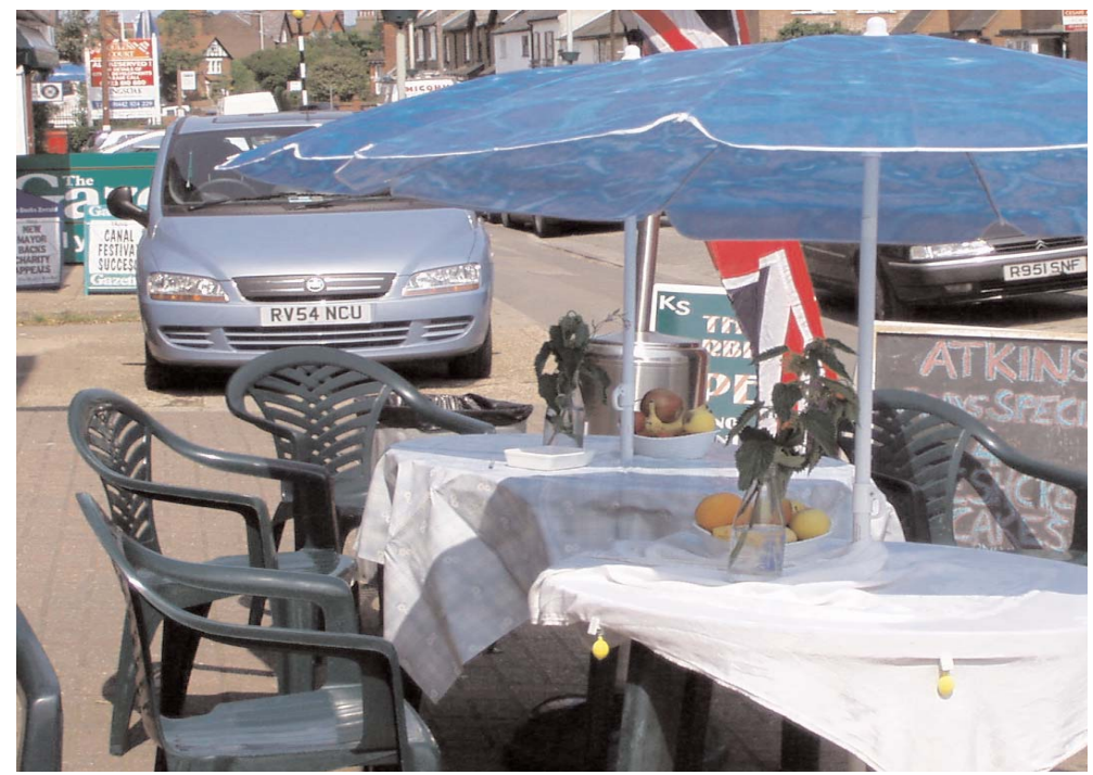
Outdoor cafe spaces, where the road is wide enough, add vitality to the town centre.

DACORUM URBAN DESIGN ASSESSMENT TRING | JANUARY 2006