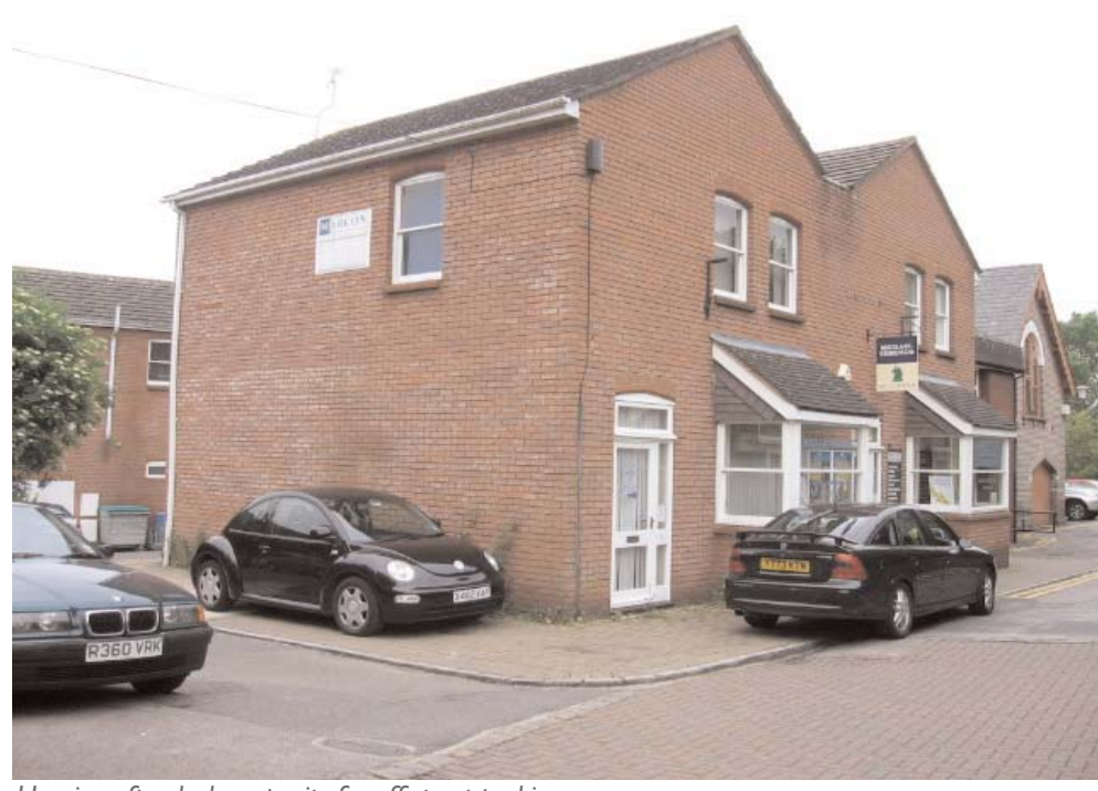
Housing often lacks capacity for off-street parking.

The car parks in Tring offer some all-day parking spaces. Some of these spots may be used by commuters who are unable to park at the station. This practice creates two problems for the town centre - one being the loss of town centre land to commuter parking and the other being the loss of the parking space for a potential town centre shopper.