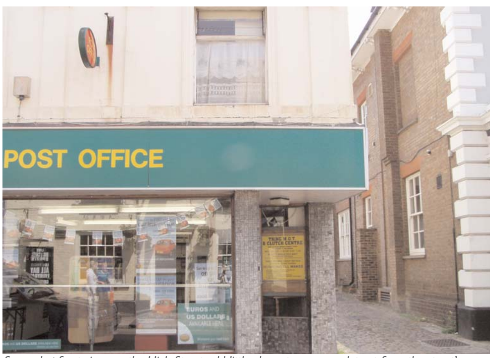
Some shopfront signs on the High Street add little character or even detract from the street's identity.