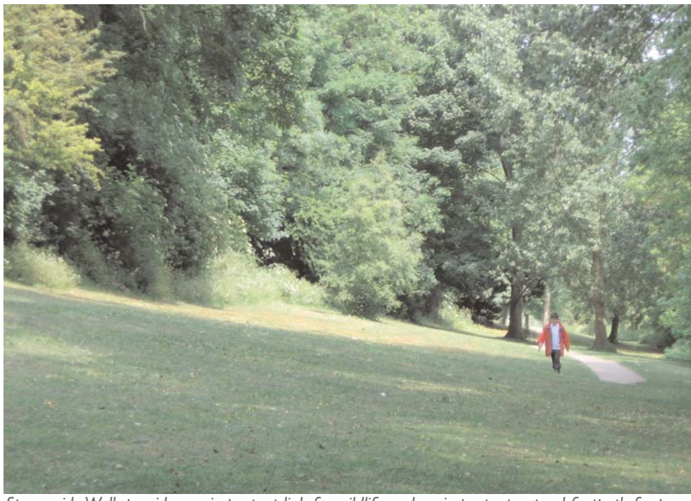
Streamside Walk provides an important link for wildlife and an important natural footpath for peo-