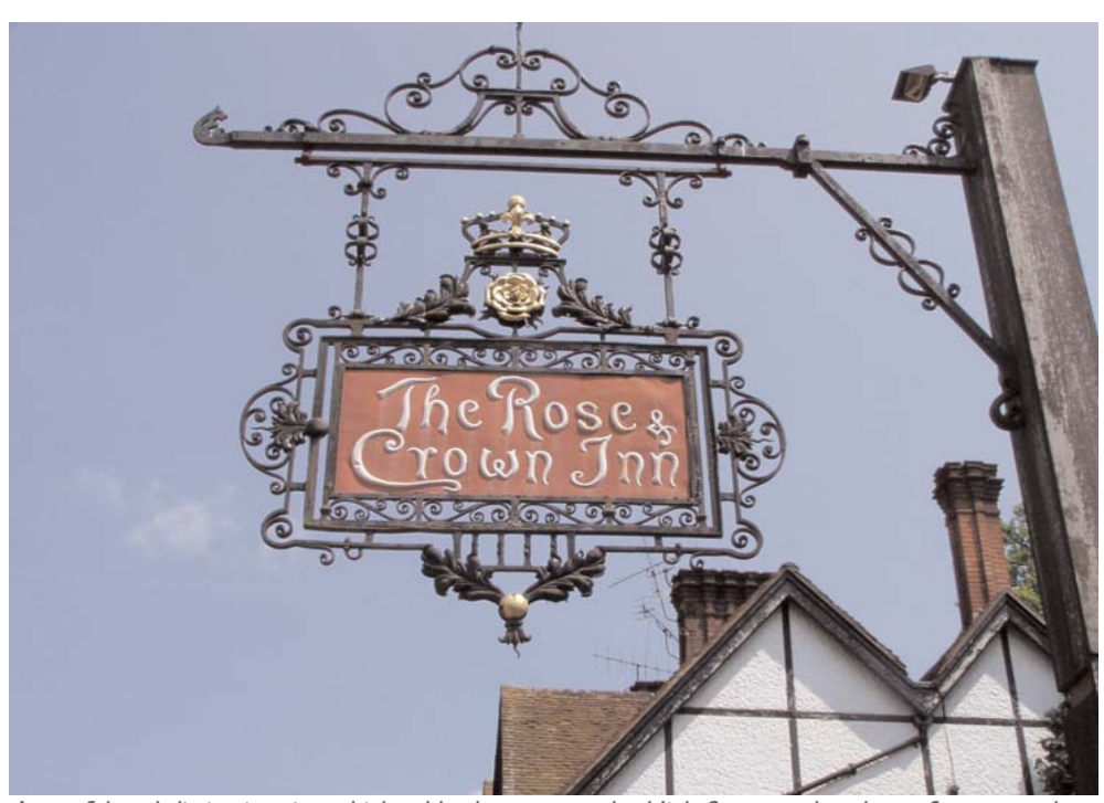
An artful and distinctive sign which adds character to the High Street and makes reference to the town's history.

Consultation participants also noted a lack of greenery and planting in the town centre.