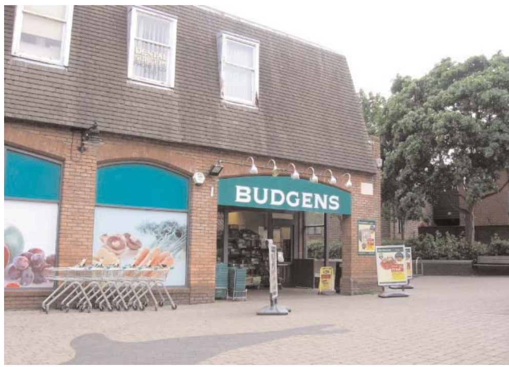
The town centre lacks greenery in terms of street trees and planters.