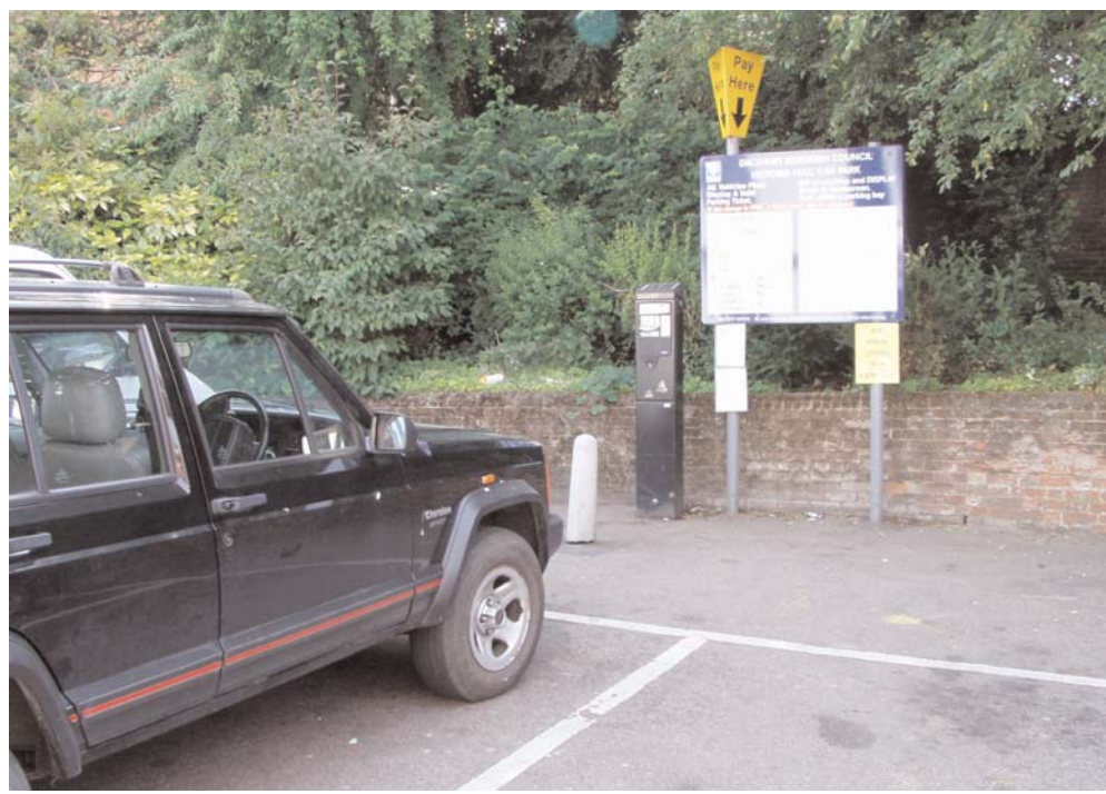
An example of off-street parking in the town centre..