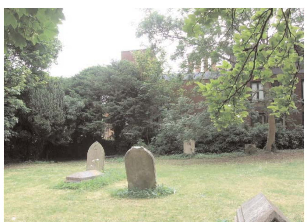
The Church cemetery is a small but significant open space adjacent to the town centre

The town centre, partly due to its narrowness, does not integrate much greenery.