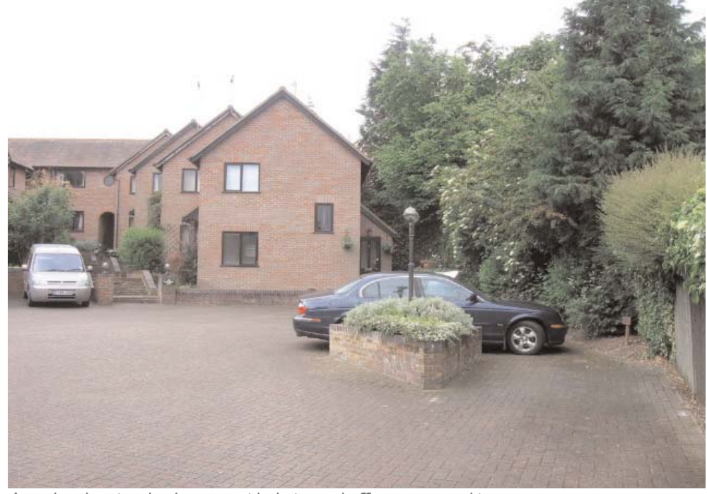
A modern housing development with designated off street car parking.