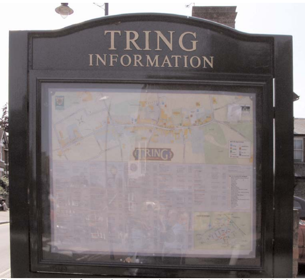
The gateway signs and information boards are not located in co-ordination with key landmarks.