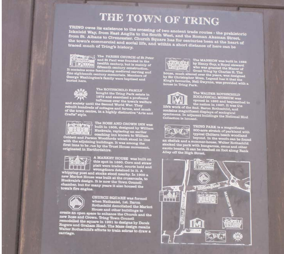
High quality signage in appropriate locations assists both wayfinding and place-making.