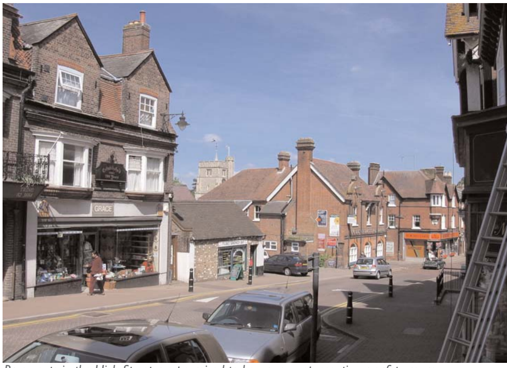
Pavements in the High Street are perceived to be narrow, representing a safety concern.