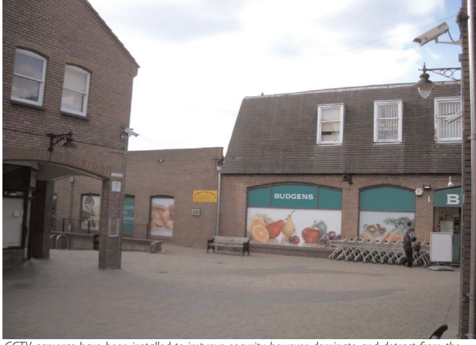
CCTV cameras have been installed to improve security, however dominate and detract from the quality of the public realm.

Several pavement areas were noted to be too narrow representing a safety concern.