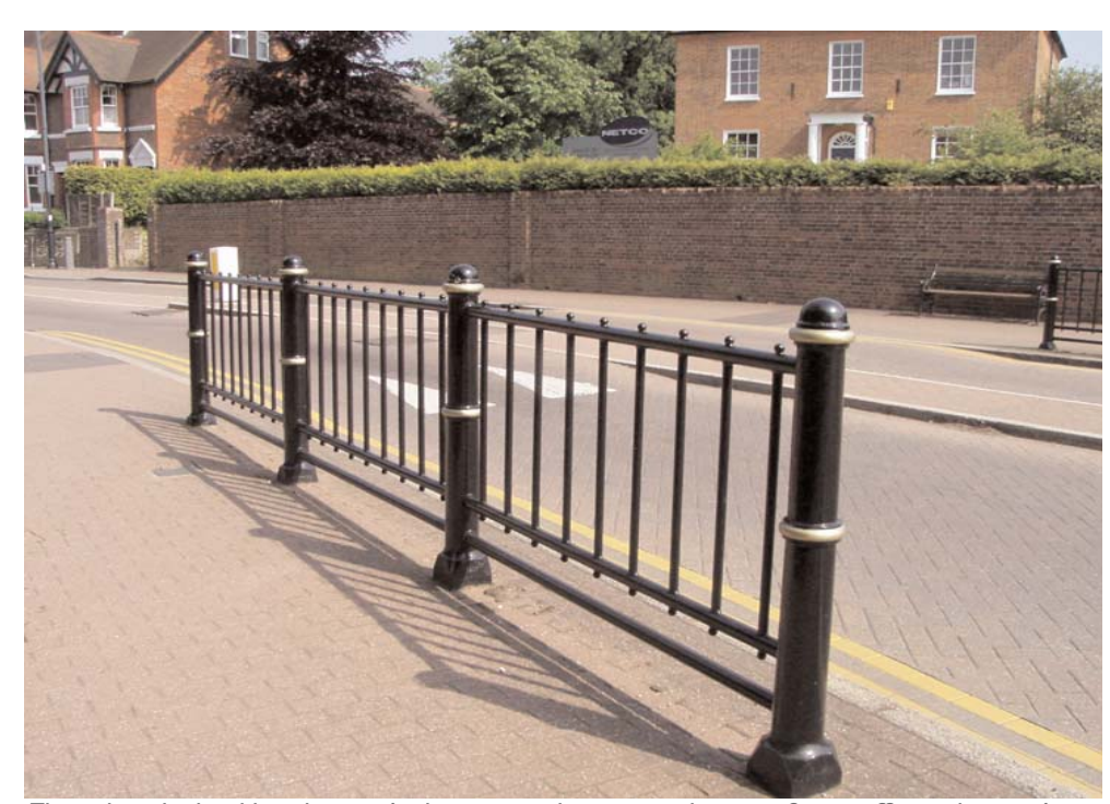
The railings both add to the town's character and protect pedestrians from traffic on the town's busy roads.

Outdoor cafes add vitality to the town centre