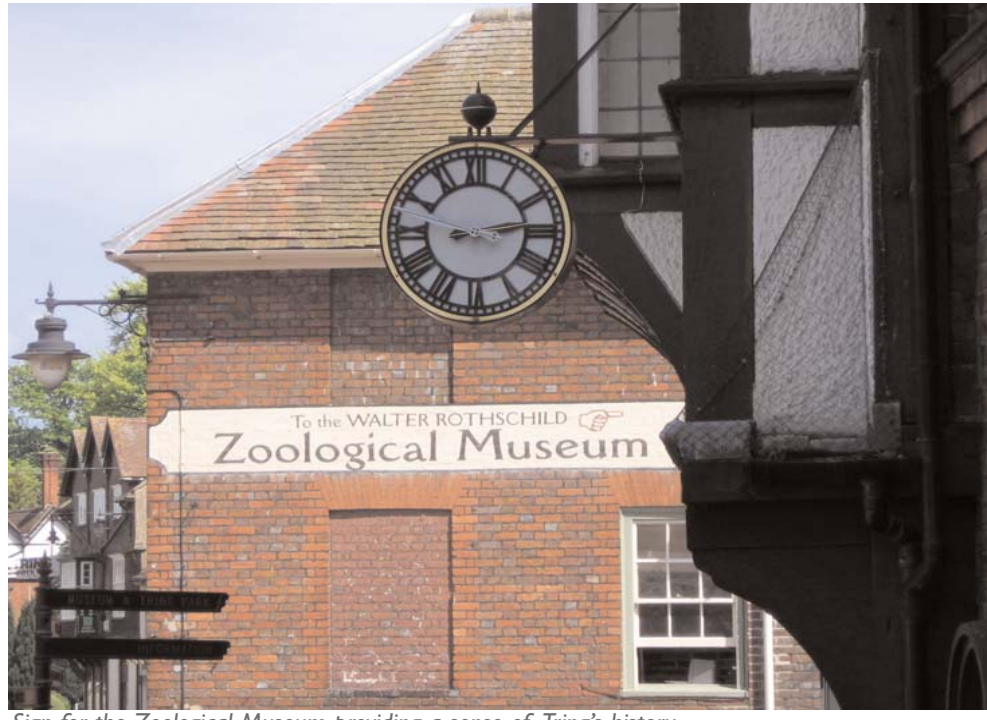
Sign for the Zoological Museum providing a sense of Tring's history.

It can be valuable to combine gateway signs with landmark buildings or places. Currently the locations of major information boards and gateway signs (the bottom far right image is located by the library) do not coordinate with key landmarks.