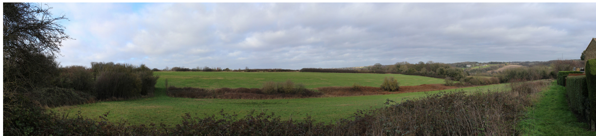
View taken from south of site looking towards south-west and south-east boundaries.