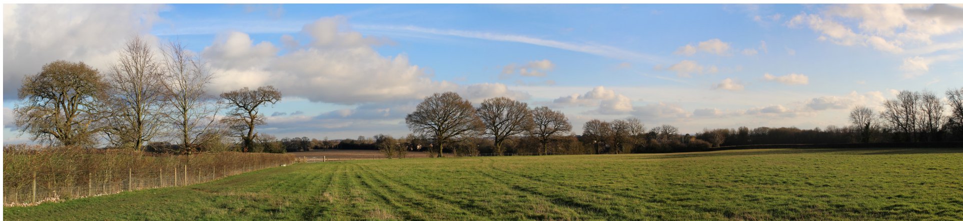
View taken from west of site looking towards north boundary.