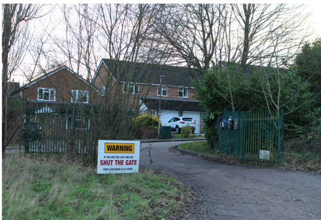
View taken on site facing Gade Valley Close on south boundary.