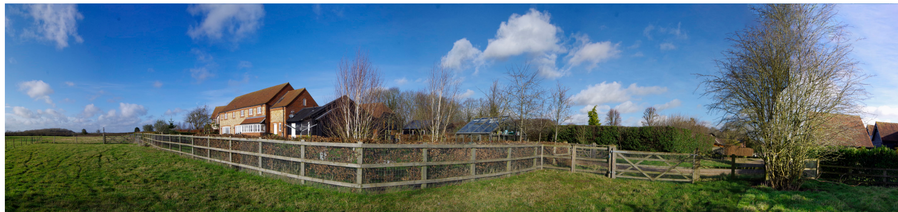
View taken from east side of site facing dwellings south of School.