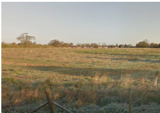
View from Bunkers Lane, facing towards the northern boundary