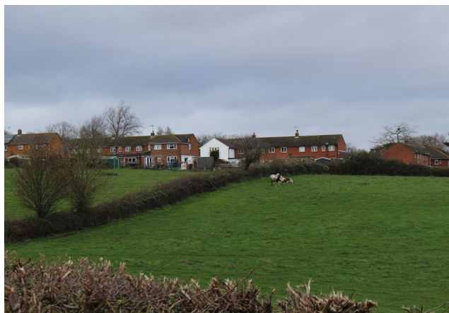
View taken from east side of site facing dwellings to north.