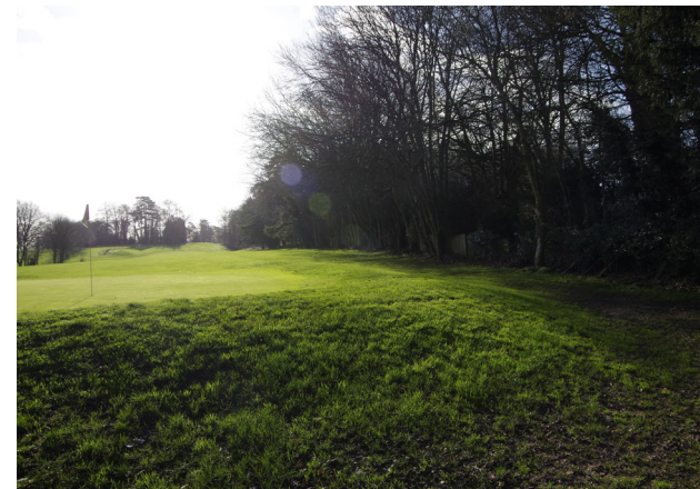
View taken from north showing a group of trees beyond the south-west site boundary.