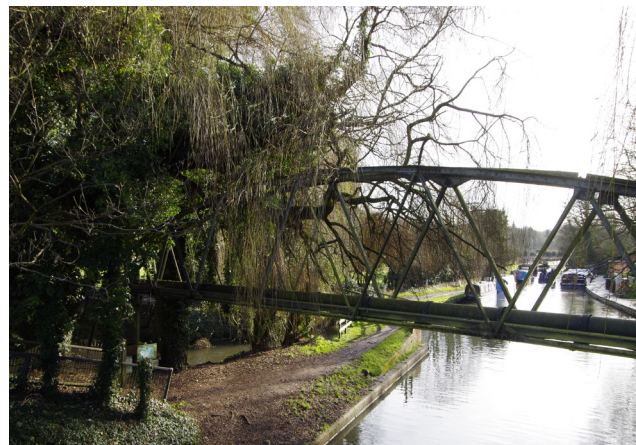
View taken from north facing section of west boundary adjacent to canal.