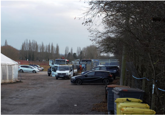
View taken from north of site facing towards tall mature trees on north boundary.