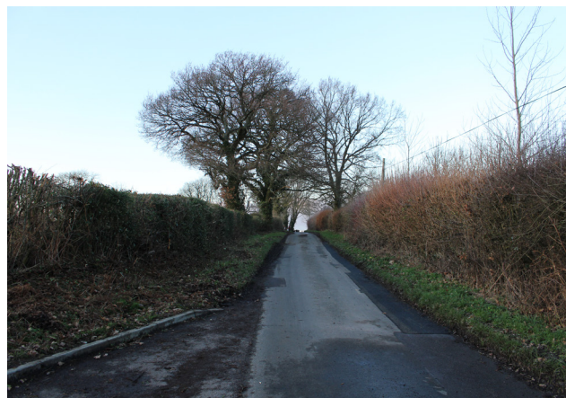
View from western boundary, facing south along Little Heath Lane