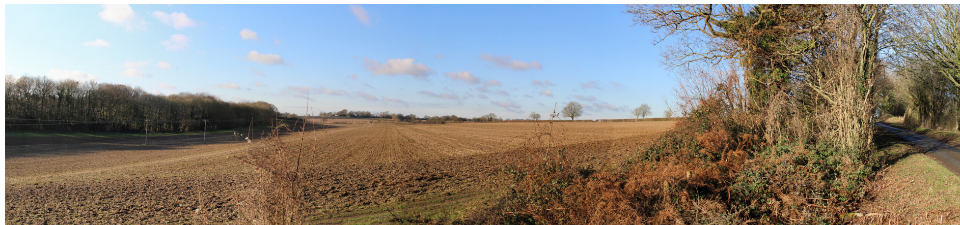
View taken from the north-east boundary looking towards south-east boundary on left.