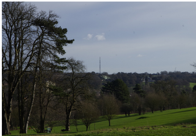
View taken from north showing north-east boundary, behind which is the railway line.