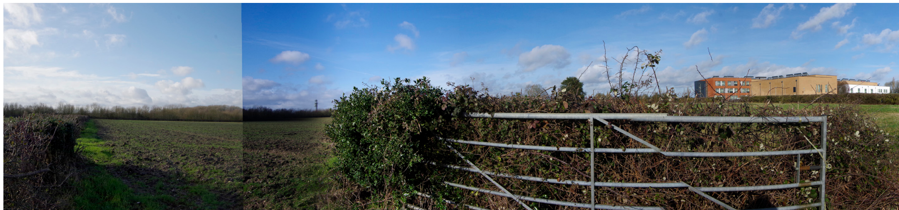
View taken from west side of site facing north boundary (on left) and Kings Langley Secondary School (on right).