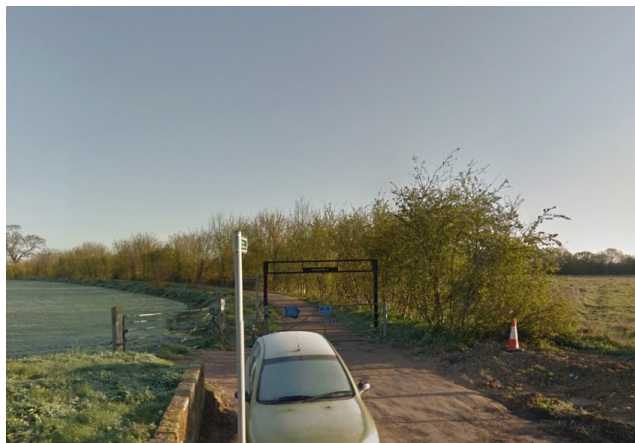
View of western boundary, formed of an unmade track