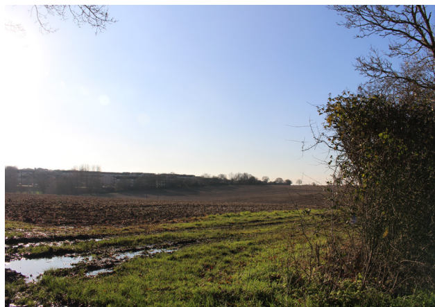
View taken from the south part of the site looking towards the south-east boundary.