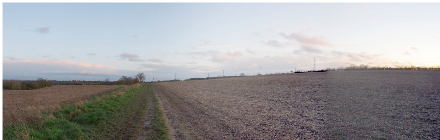
View taken from east side of site looking south-westwards.