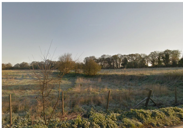
View from Bunkers Lane, facing towards the eastern boundary