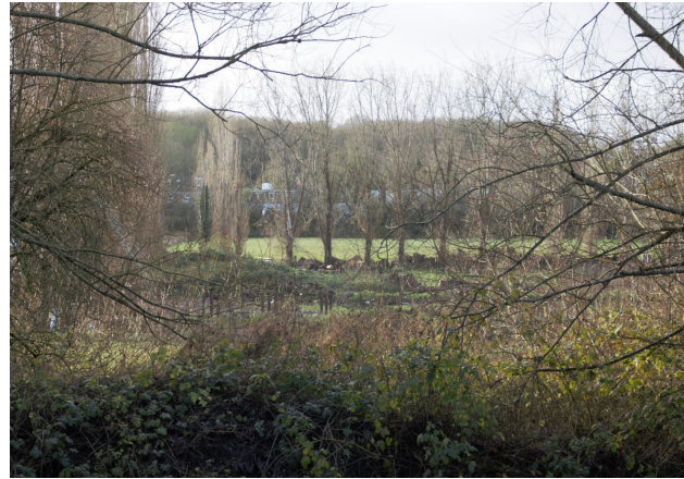
View taken from east of site facing towards the canal bank on east boundary.