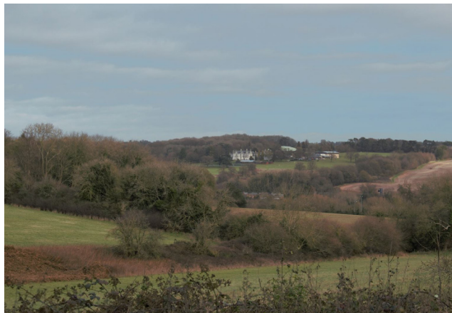
View taken from south of site looking towards east section of north-east boundary.