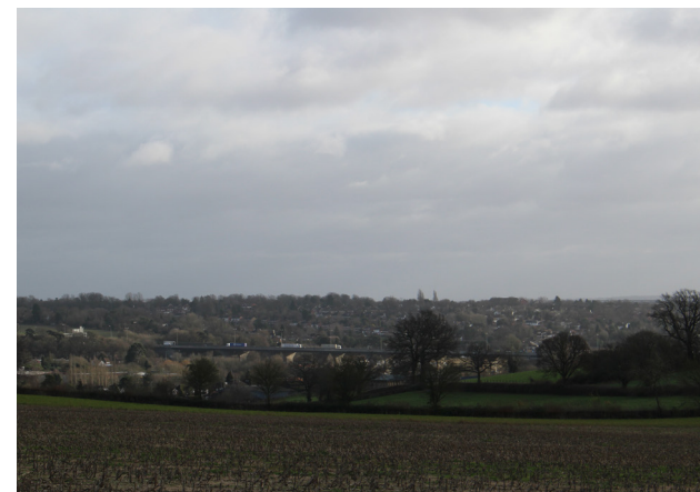
View taken from south of site facing south-east.