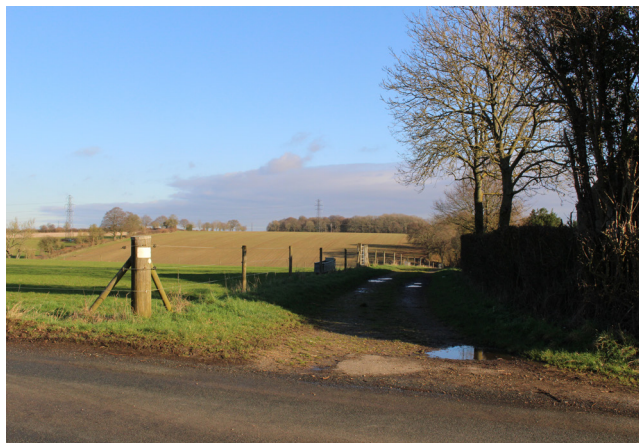
View taken from the north part of the site looking towards the north boundary on the left.