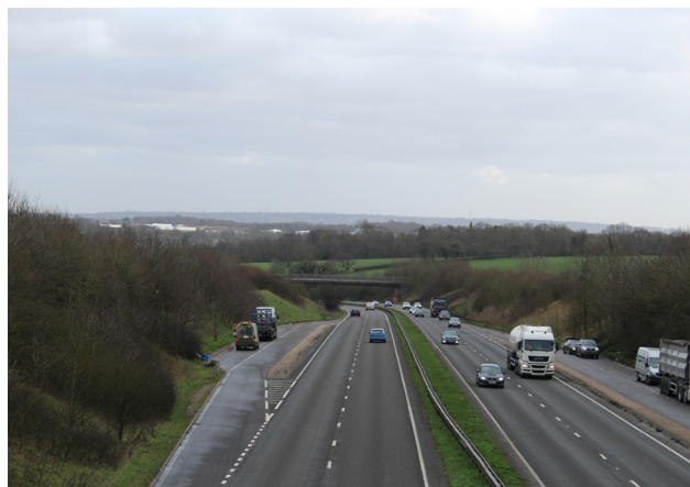
View taken beyond west side of site looking onto A41 highway.