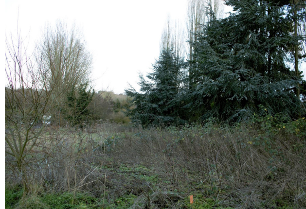
View taken on site facing trees on eastern side of south boundary.