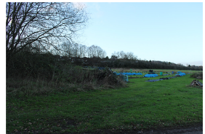
View taken on site facing trees on western side of south boundary and hedging along west boundary.