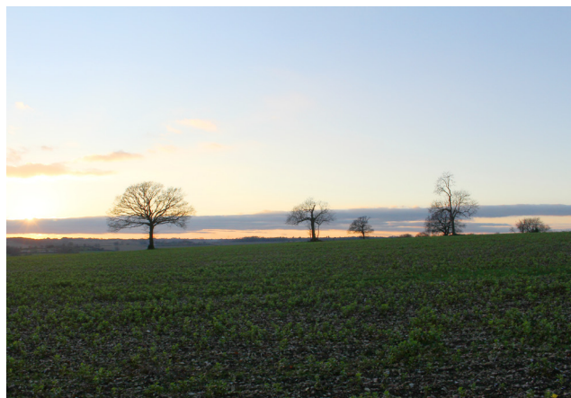
View from eastern boundary facing west across the site to a line of intermittent trees