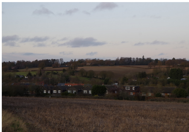
View taken from east side of site looking north-eastwards.