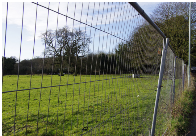
View taken from north facing weaker section of west boundary. Outlying trees shown on left.