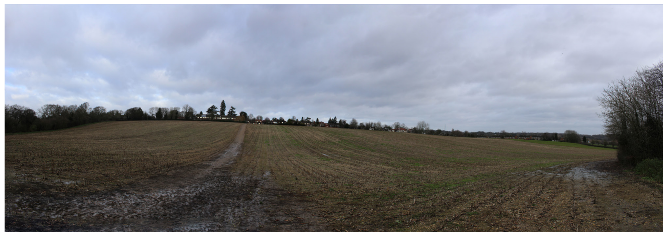
View taken from west side of site facing north boundary.