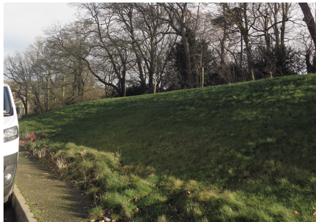
View taken from north showing roadside adjacent to north-west boundary.