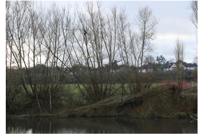
View taken from east of site facing towards canal bank on east boundary and red football pitch fencing on north boundary (right of photo).