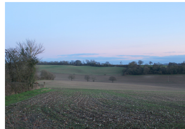
View from western boundary, facing south east across the site