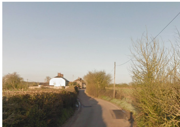
View along Bunker Lane, facing west