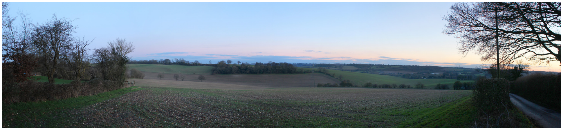
Panoramic view from eastern boundary