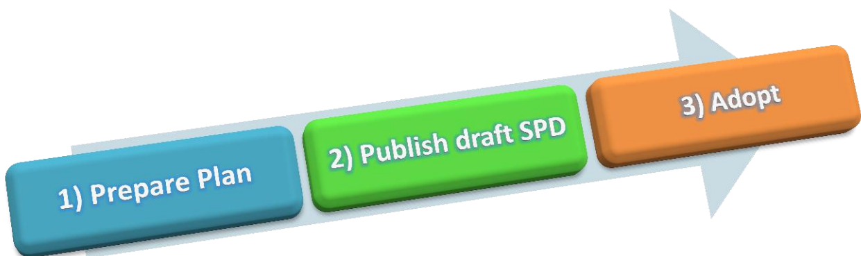
Figure 3: Stages in Supplementary Planning Documents

4.13 Figure 3 below identifies the stages used in the preparation of Supplementary Planning Documents. References to regulations relate to the Town and Country Planning (Local Planning) (England) Regulations 2012.