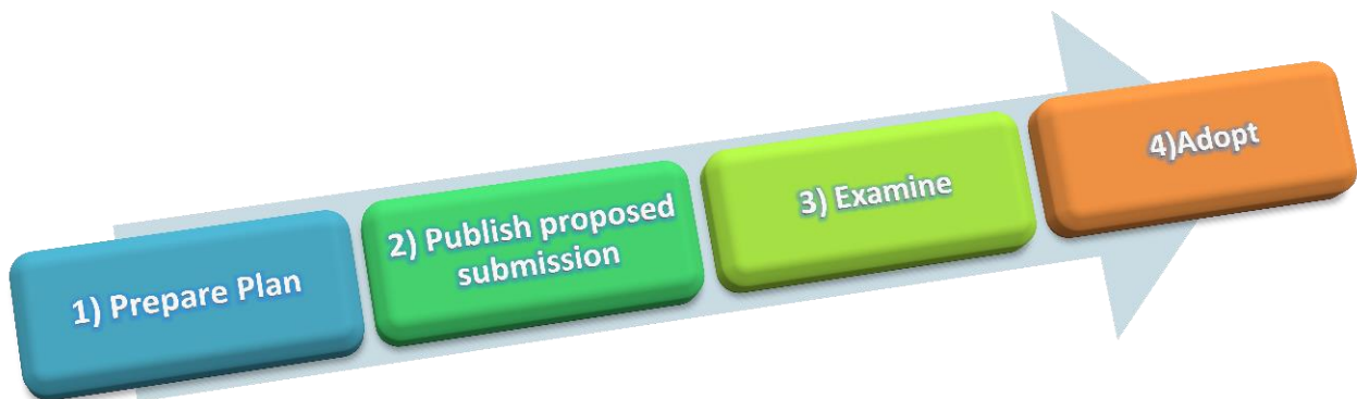
Figure 2: Stages in preparing the Local Plan

4.11 Arrangements for consultation will depend on which stage the plan has reached (see Figure 2). These arrangements are summarised below. References to regulations relate to the Town and Country Planning (Local Planning) (England) Regulations 2012.