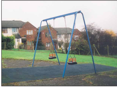
Existing play space on site overlooked by housing off King Edward Street