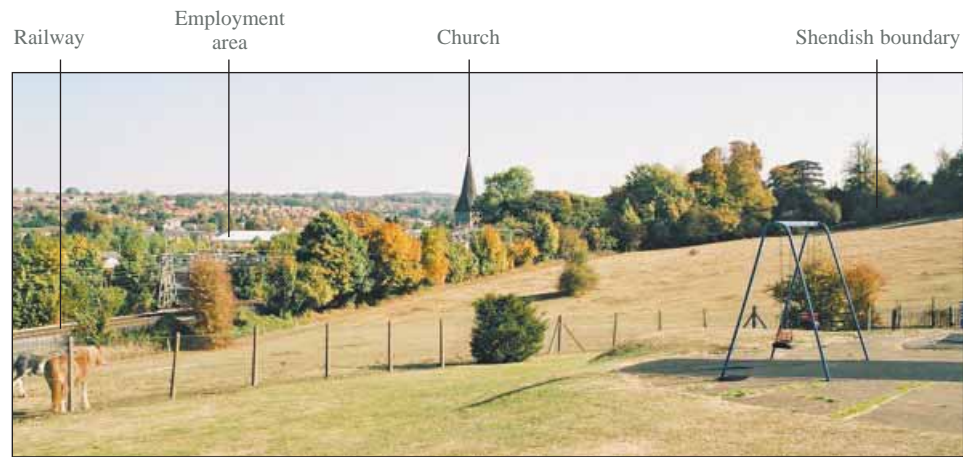
View looking east towards St.Mary's Church