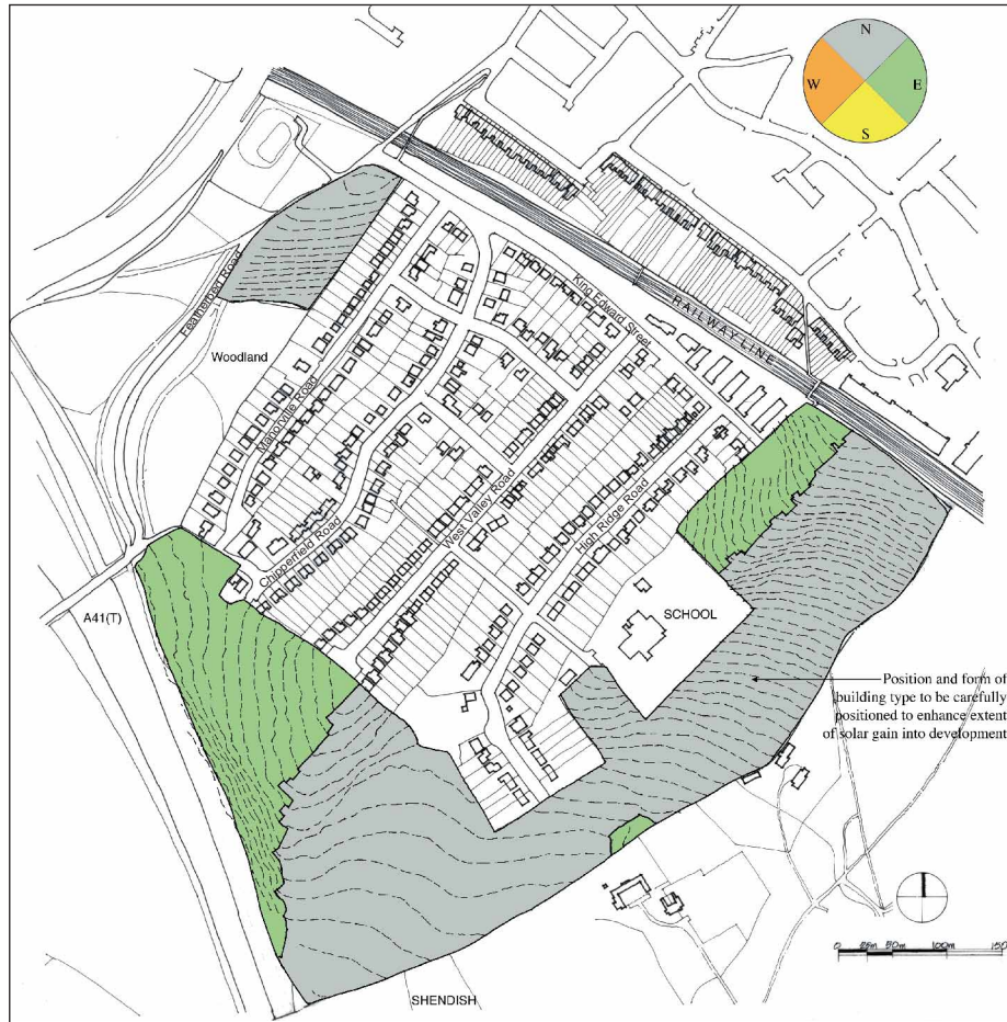
Solar gain and orientation of landform