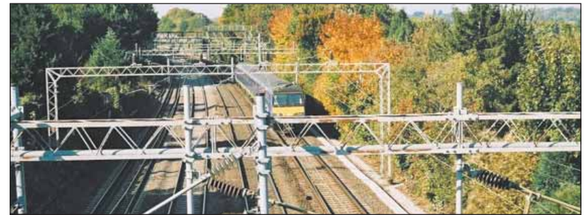
The adjoining mainline railway to the north - east of the site provides a strong edge to the development site

Further information will be required on how the environmental and ecological enhancements will be achieved.