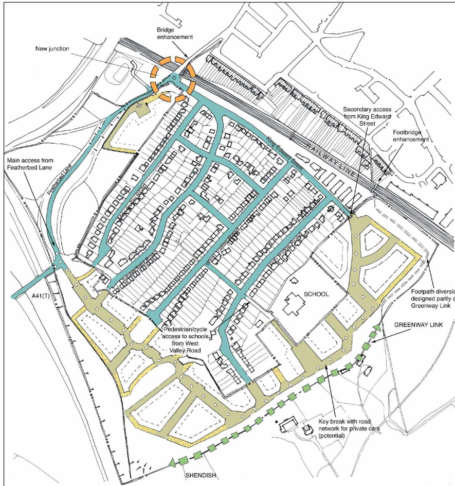
Movement network strategy