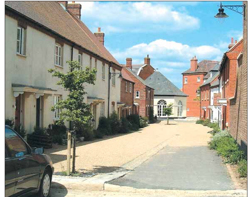
Pedestrian priority streets will provide a safer environment and a safer modern version of the local 'snicket'