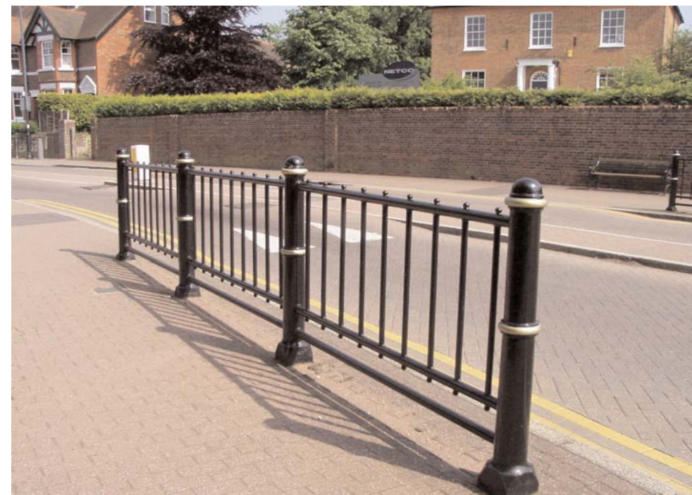
The railings both add to the town's character and protect pedestrians from traffic on the town's busy roads.

QPRI D Outdoor cafes add vitality to the town centre.