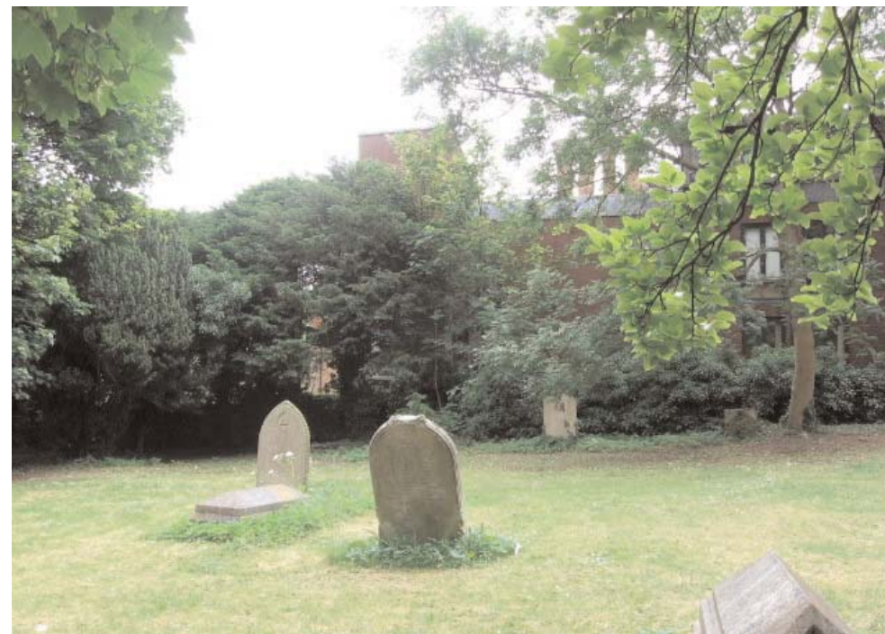
The Church cemetery is a small but significant open space adjacent to the town centre

QPR2B The town centre, partly due to its narrowness, does not integrate much greenery.