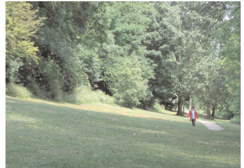
Streamside Walk provides an important link for wildlife and an important natural footpath for people.