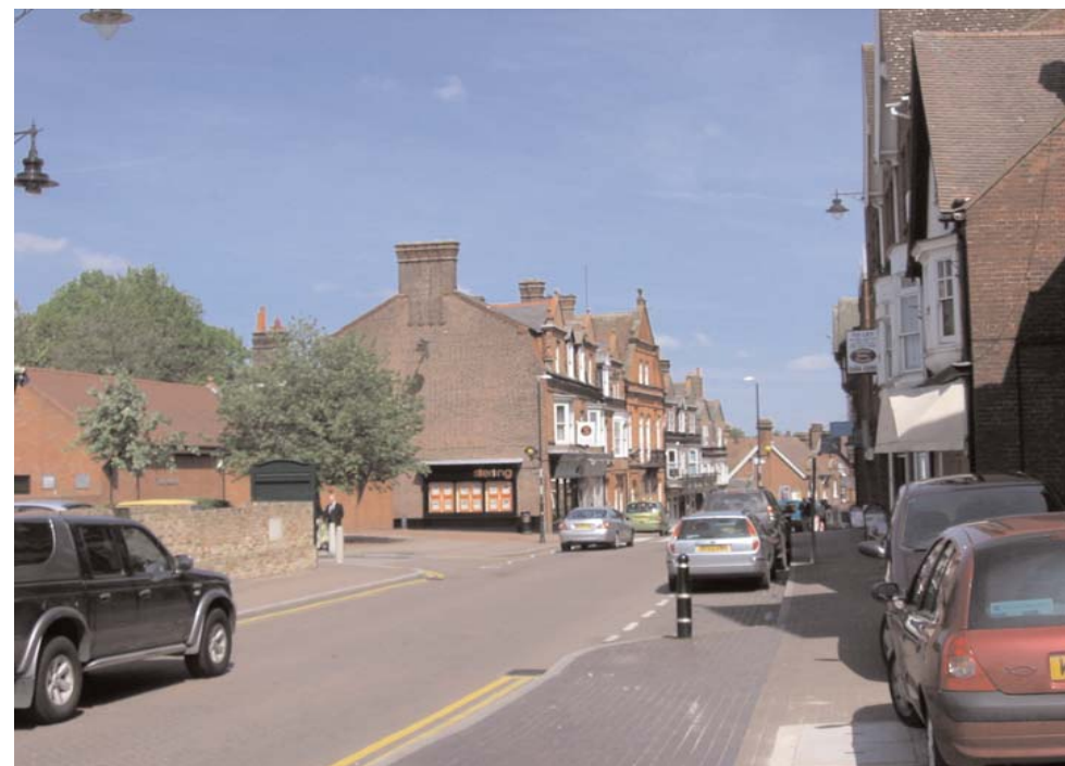
There are few opportunities for on street parking in the High Street.

Commuter parking in the town centre negatively affects the town centre.