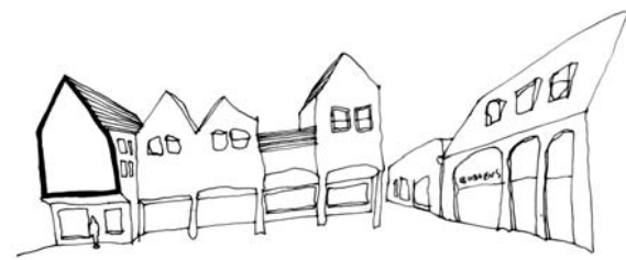
Dolphin Court opened up to evening economy uses.

There are also a considerable number of financial and professional services in the town centre. The library, the most active civic institution presence in the town centre, is at the western end of the town centre on the High Street. There are no residential uses (ground floor) in the town centre. The land uses down Akeman Street tend to be more business-focused.