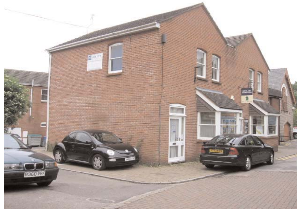
Housing often lacks capacity for off-street parking.

The car parks in Tring offer some all-day parking spaces. Some of these spots may be used by commuters who are unable to park at the station. This practice creates two problems for the town centre - one being the loss of town centre land to commuter parking and the other being the loss of the parking space for a potential town centre shopper.