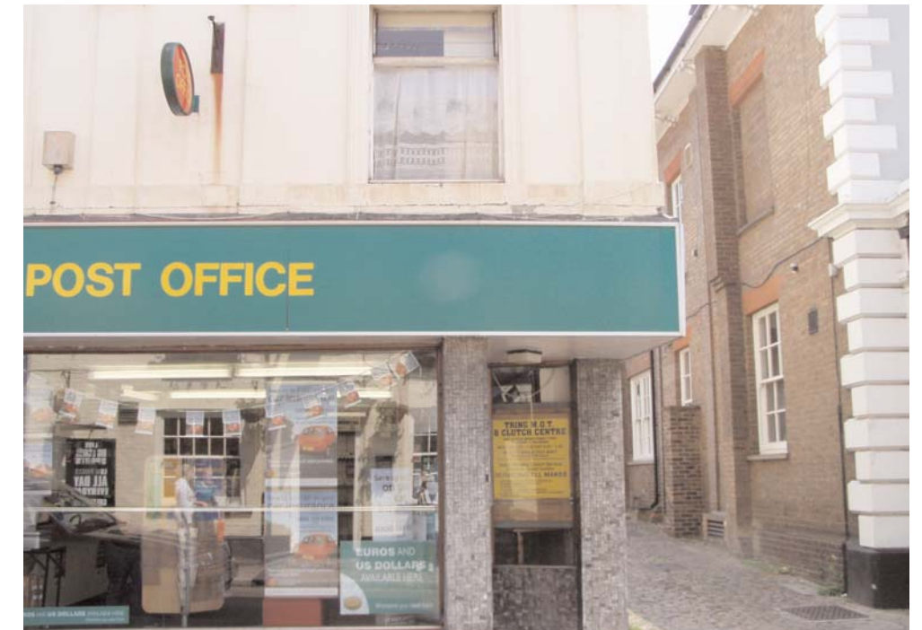
Some shopfront signs on the High Street add little character or even detract from the street's identity.