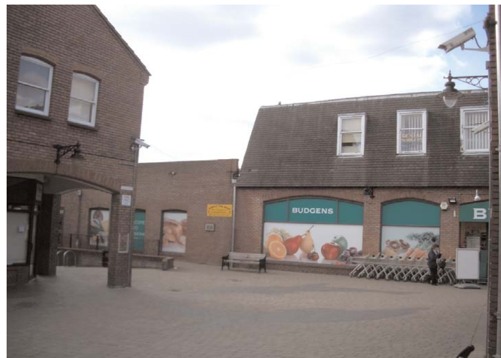
CCTV cameras have been installed to improve security, however dominate and detract from the quality of the public realm.

There are a number of places where both streetlighting and CCTV cameras have been installed to improve a sense of safety. It should be noted that in a few particular instances the CCTV cameras have been installed in such a way that they detract from the quality of the public realm.