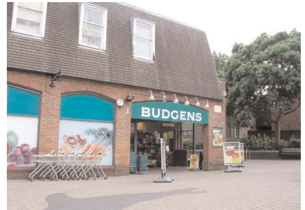
The town centre lacks greenery in terms of street trees and planters.