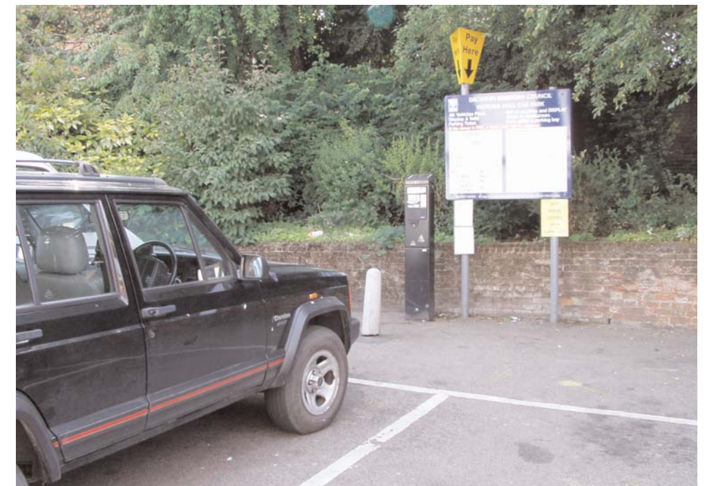
An example of off-street parking in the town centre..