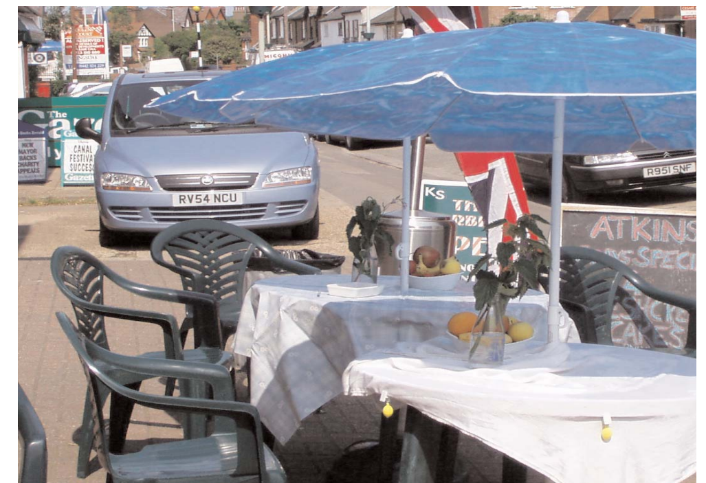
Outdoor cafe spaces, where the road is wide enough, add vitality to the town centre.