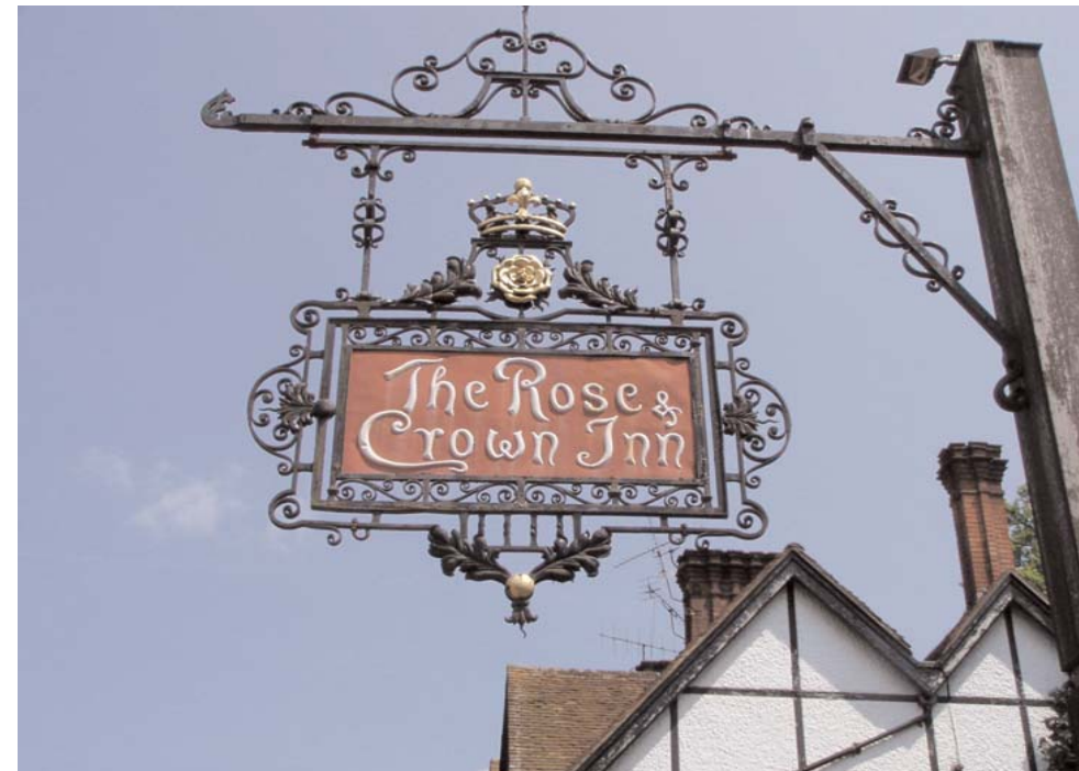
An artful and distinctive sign which adds character to the High Street and makes reference to the town's history.

Consultation participants also noted a lack of greenery and planting in the town centre.