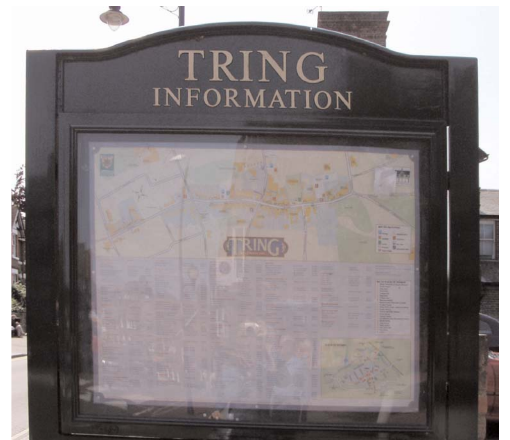
The gateway signs and information boards are not located in co-ordination with key landmarks.