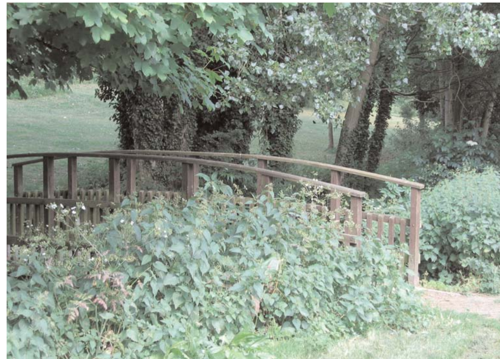
A footbridge crosses the brook - Streamside Walk

The open spaces adjacent to the town centre are small but significant, including the Tring Church Cemetery and the Memorial Gardens. In general, the town centre does not have much greenery in terms of street trees or planters.