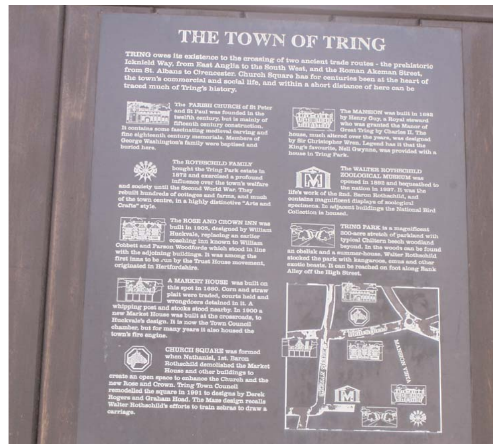
High quality signage in appropriate locations assists both wayfinding and place-making.