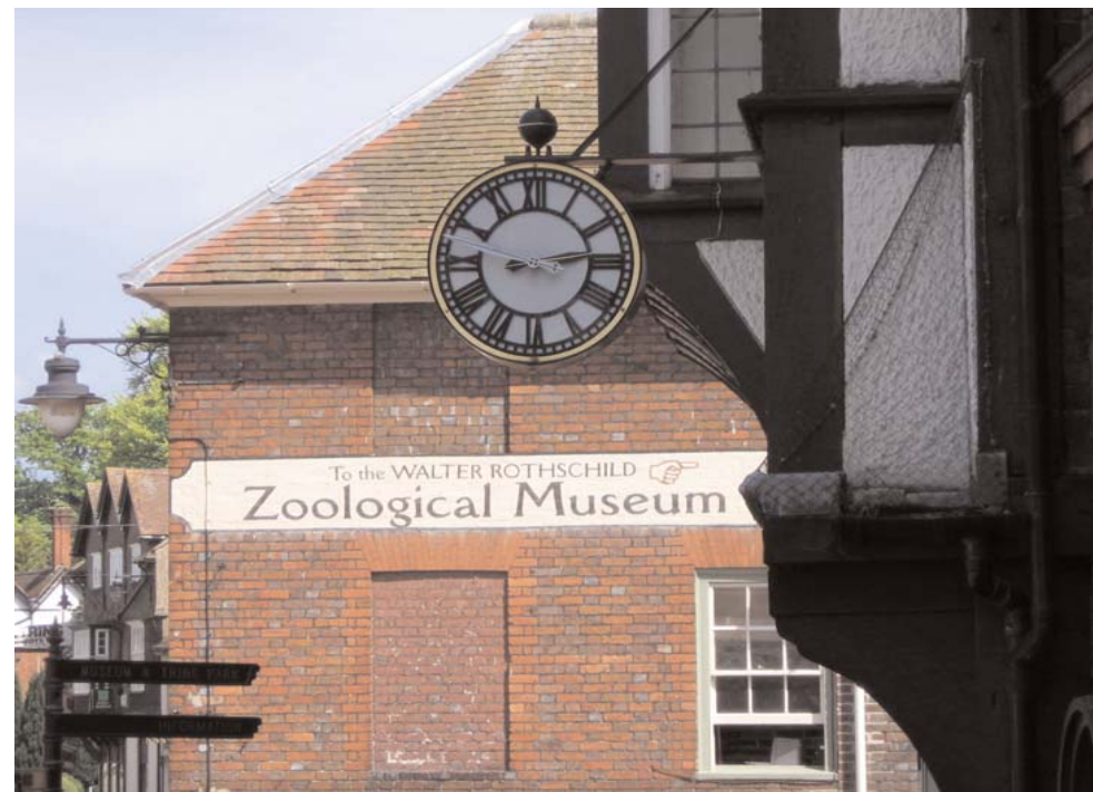
Sign for the Zoological Museum providing a sense of Tring's history.

It can be valuable to combine gateway signs with landmark buildings or places. Currently the locations of major information boards and gateway signs (the bottom far right image is located by the library) do not coordinate with key landmarks.