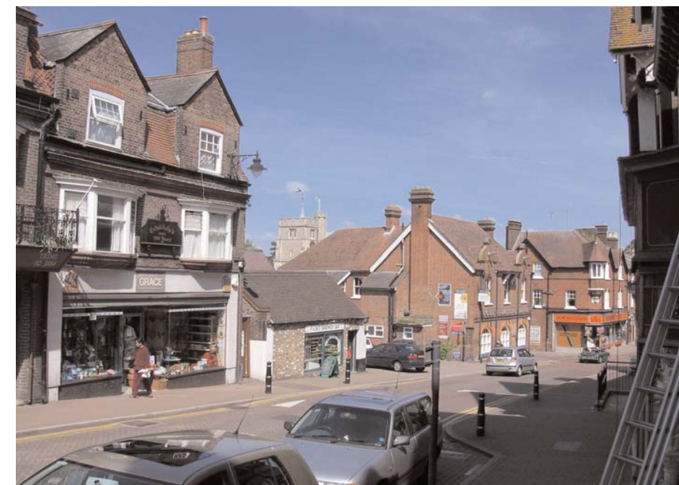
Pavements in the High Street are perceived to be narrow, representing a safety concern.