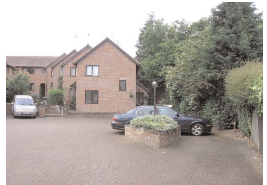
A modern housing development with designated off street car parking.