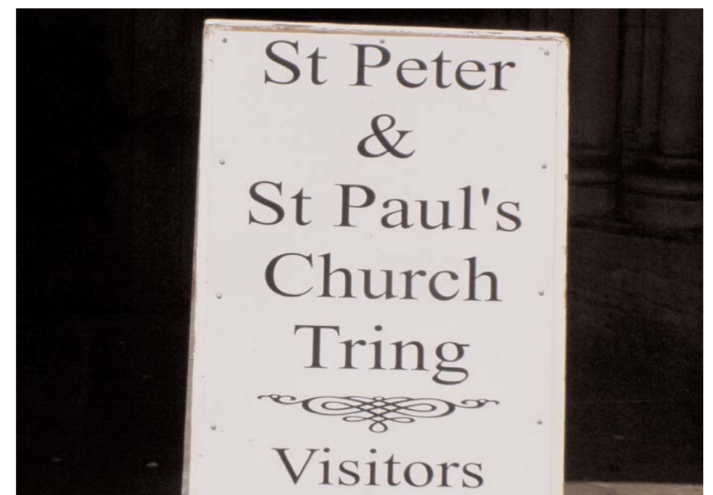
Distinctive signage attracting visitors to St. Paul's church