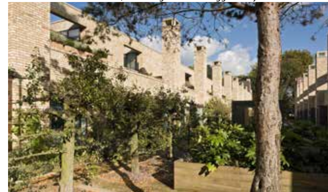
Accordia, Cambridge. Feilden Clegg Bradley.

To draw on local historic development patterns in the design of new places and to continue traditions which reinforce local distinctiveness.