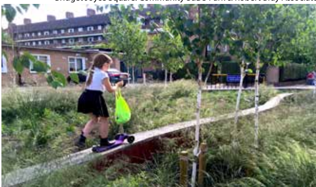
Bridget Joyce Square. Community SuDS Park & Robert Bray Associates

8.3.3 SuDS measures should be designed at or near the surface and located with discharge routes following the SuDS hierarchy. Infrastructure may be located in informal or semi-natural areas of open space, parks and amenity green spaces (using, for example, measures such as swales or attenuation ponds), as well as in built up areas (using, for example, measures such as rills, rain gardens and green walls and roofs).