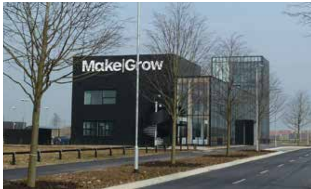
The Enterprise Centre, Alconbury

To accommodate changing work patterns, such as home working and flexible hours, and create the opportunity to integrate economic activity with residential areas, creating vibrant places, and opportunities for local employment and flexible work patterns.