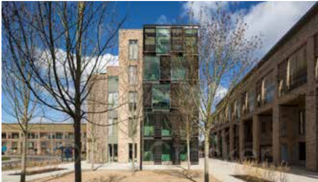
Abode, Cambridge. Proctor & Matthews Architects.

To embed place hierarchies based on the inter-play between density, accessibility, function and scale to create active, memorable places and legible neighbourhoods.