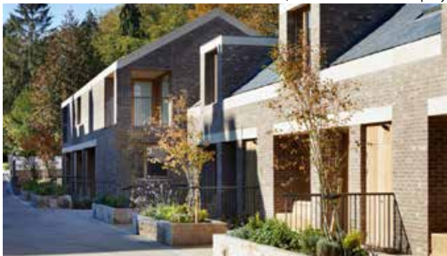
Wilderness Mews, Sevenoaks. Morris+Company

To enhance civic pride, improve the appearance of a place over the long-term, reduce maintenance requirements and improve wayfinding using high quality, long-lasting materials.