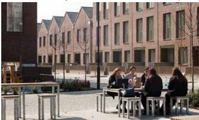
Dujardin Mews, Enfield. KCA & MLA.

To facilitate social interaction through creating great streets and spaces, which help build social ties and inclusivity, with the knock-on impacts of improving mental health and reducing social isolation.