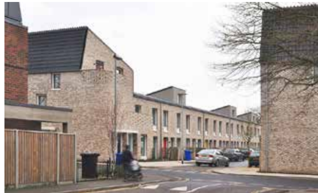
Goldsmith Street, Norwich. Mikhail Riches.