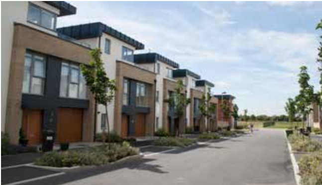
Beaulieu Park, Chelmsford

To ensure a high standard of maintenance is possible at all times in order to contribute to place quality and local civic pride.