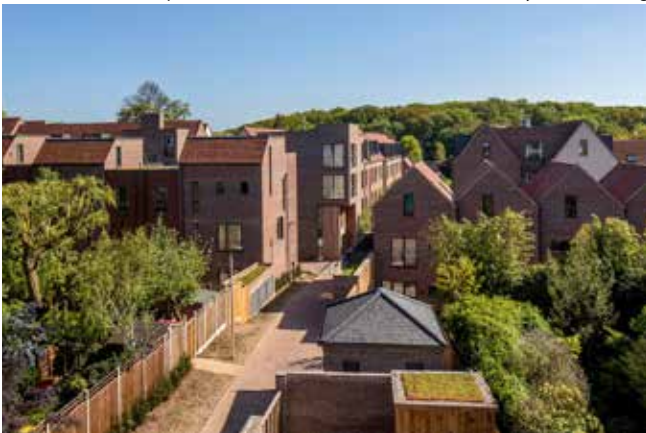
Woodside Square, Pollard Thomas Edwards.

The homes we build over the coming decades need to drive a change in residential architecture and move towards locally distinctive, contemporary housing which meets the needs of residents whilst responding to the characteristics of a place. Additionally, these homes need to surpass those of recent times to achieve far greater levels of sustainability in their construction and operation.