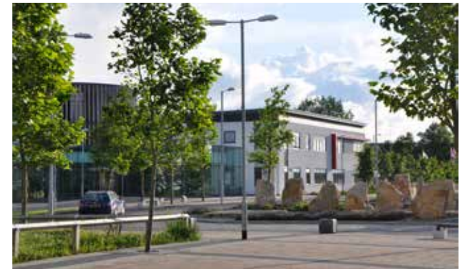
The Enterprise Centre in Priors Hall, Corby

To achieve functional integration between new and existing communities through the provision of new facilities, or by enhancing the existing facilities present in adjacent neighbourhoods.