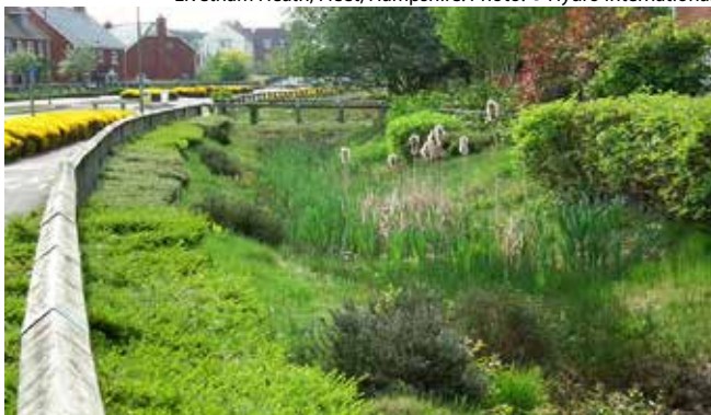
Elvetham Heath, Fleet, Hampshire.

To maximise opportunities for natural drainage at all project stages, from masterplanning through to detailed design to ensure the development and local watercourses are protected in the event of extreme rainfall.