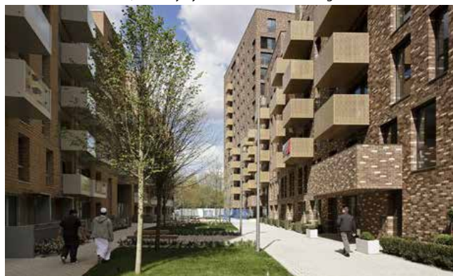
St Andrews, Bromley by Bow. Maccreeanor Lavington.

To generate a sense of safety in the urban realm by ensuring public realm is visible and is strengthened by passive surveillance from homes and businesses.