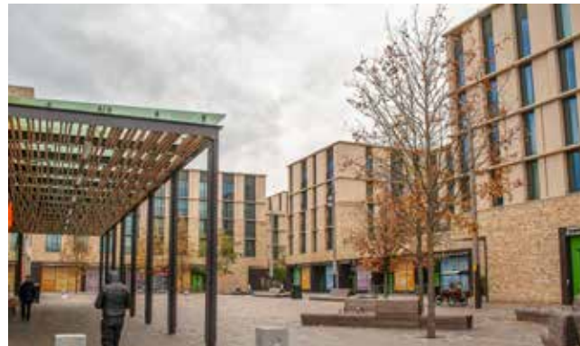
Eddington Square, Cambridge

To create compact, walkable neighbourhoods as the building blocks of successful communities, with easy and environmentally friendly access to everyday facilities.