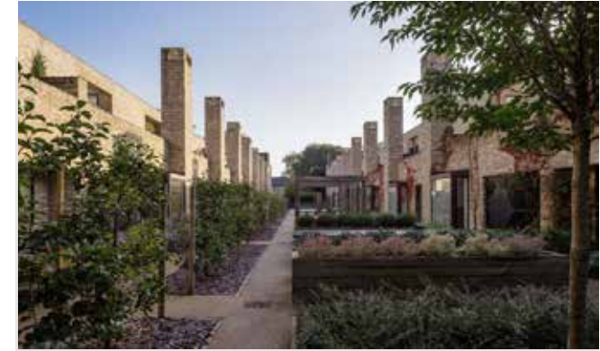
Accordia, Cambridge. Grant Associates.

To design comfortable outdoor spaces that protect against excessive sun, re-radiated heat and do not create cold, windy or gusty environments, in order to significantly extend the usable period of outdoor public spaces for all users.