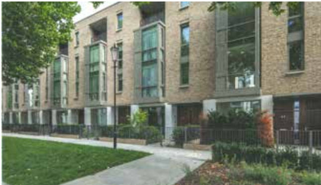
Portobello Square. Kensington. PRP.

To design homes which which positively address the street.