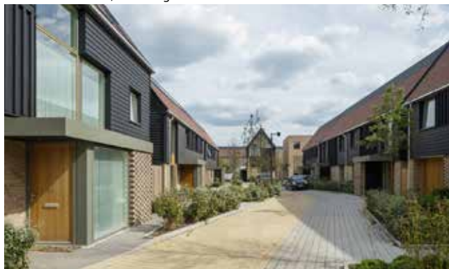
Abode, Cambridge. Proctor & Matthews Architects.

To employ the Design Process set out in this Guide (Part 1) to build a place narrative as a starting point for exemplar design which responds to the local context.