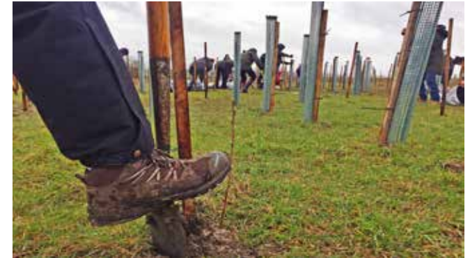
Milton Keynes' Parks Trust

To provide certainty about the management, maintenance and funding of community assets. Hertfordshire has pioneering examples of how this can be done successfully through the original Garden Cities, and later with the New Towns.