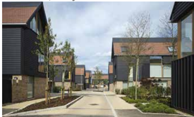
Abode, Cambridge. Proctor & Matthews Architects.

To design places which prioritise people, active and public transport and, lastly, private vehicle users.