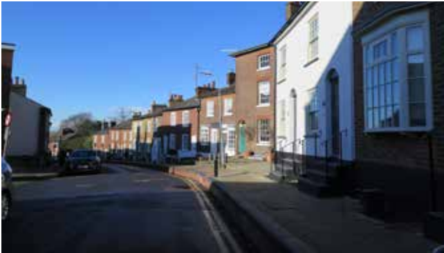
Fishpool Street, St Albans

To use all land efficiently and effectively and ensure no ambiguous spaces are created.