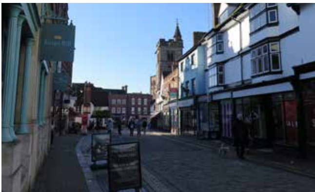
Market Place, St Albans

2.2.4 Measures to minimise adverse impacts from co-location of uses, such as the use of landscape buffers for industrial buildings or separate service access for large-footprint retail units.