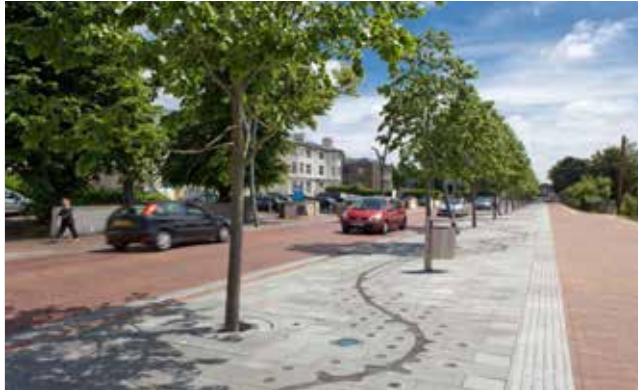
Elwick Road, Ashford. Turkington Martin

To use street trees to provide shade and reduce heat in summer, improve environmental quality, slow or capture surface water run off, provide visual variety and interest and to reinforce green infrastructure networks and to connect green spaces.