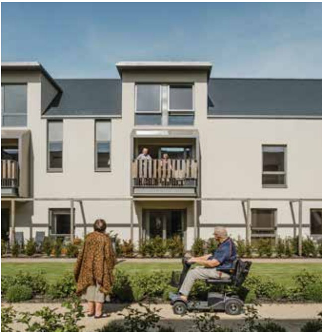
Steepleton, Tetbury. Proctor & Matthews Architects.

Buildings, streets and spaces should be welcoming and should meet the needs and wants of people. The Guide demonstrates how new developments can be welcoming to and meet the needs of all people.