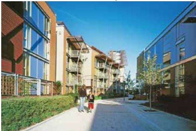
Greenwich Millennium Village, Greenwich. Proctor & Matthews

Public spaces, including streets, squares, open spaces and focal points, determine the character of an area and its identity. Successful public spaces are well-used by a range of people, facilitated by designs which promote a sense of safety, comfort and pedestrian priority.