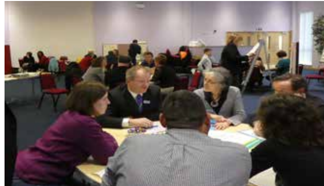
Masterplanning workshop with key stakeholders for a site.

To ensure compliance and consistency with the approved vision for a development throughout the delivery process.