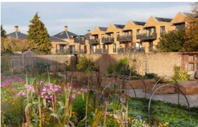
New Ground co-housing, High Barnet

The long-term sustainability of a place requires proactive stewardship by, and on behalf of, the community. Good places are designed and constructed with an eye to ease of management and maintenance, with quality and robust detailing and materials that minimise the potential for damage and replacement. A good place has a clear approach to phasing that supports placemaking from the very start.