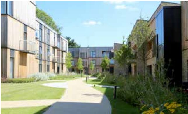
Clock House Gardens, Welwyn Garden City

To create streets and spaces that are human in scale through careful consideration of proportion and enclosure. Reference should also be made to local examples of best practice.