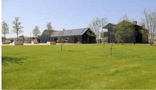
Milton Keynes' Parks Trust

To help new communities establish themselves well before the scheme is fully built-out.