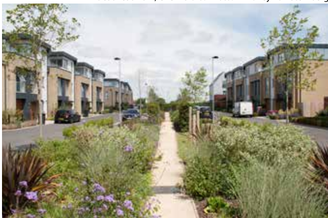
Beaulieu Park, Chelmsford.

Resilience to climate change should inform every stage of the design and development process, with an emphasis on capturing opportunities for habitat creation, water conservation and green energy production.