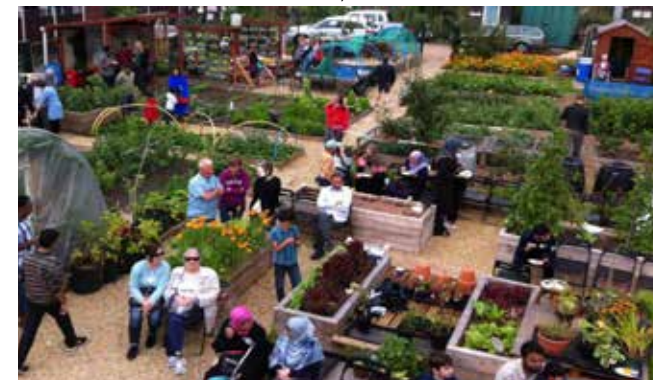
Incredible Edible, Salford.

To provide community food infrastructure, through the provision of and access to growing spaces.