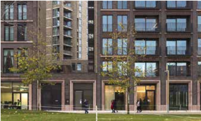
Fenman House, Camden. Maccreanor Lavington.

To ensure servicing for commercial, retail or catering units does not dominate the street or frontages.