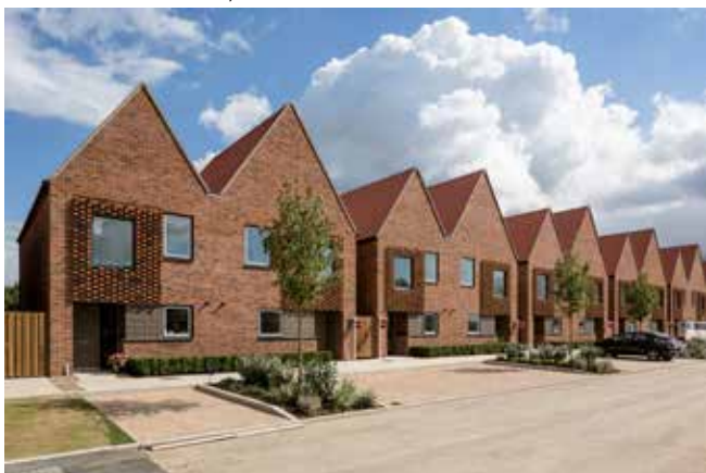
Horsted Park, Kent. Proctor & Matthews Architects.

Design explorations that are informed by a site's wider economic, social, historical and physical contexts lead to the creation of a strong 'Narrative of Place'. Taken from the perspective of the resident or visitor, each new neighbourhood should unfold through a sequence of consciously curated spaces and design details that link a site back to its wider urban and / or rural context.