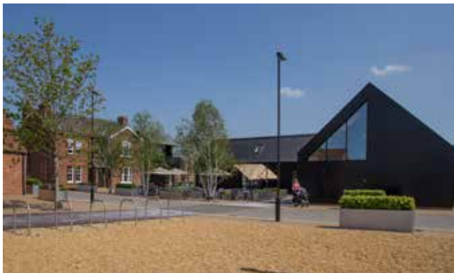
Dollman Farm, Houlton, Rugby

To enrich the narrative of place through the integration, renovation and reuse of existing heritage assets.