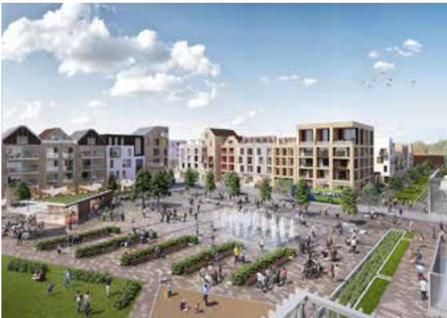
Northstowe Town Park. CGI: Allies and Morrison for Homes England

4.2.4 Locations where temporary uses could be provided to support the development of community and place during the phased build-out of the site.