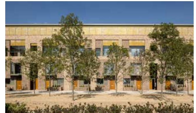
Abode, Cambridge. Proctor & Matthews Architects.

To provide housing for all socio-economic groups as a vital part of creating mixed, integrated neighbourhoods and facilitating social cohesion.