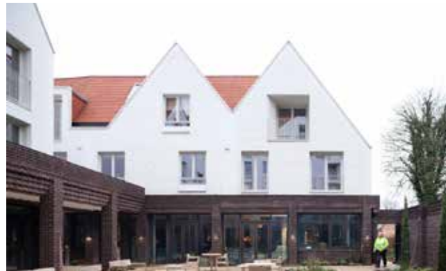
Park House, Harpenden. RCKA.

To achieve integrated and inclusive neighbourhoods that can accommodate people in homes that meet their needs and care requirements, enabling them to remain within their community at each stage of their lives.