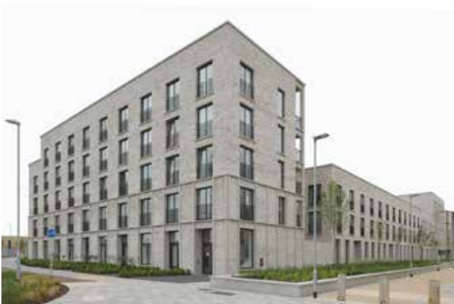
Ryle Yard, NW Cambridge. Maccreanor Lavington.

Buildings and spaces need to be designed and constructed with adaptability in mind and anticipating social, economic and technological trends.. Over the longer term this will save resources and materials and will avoid disruption to urban life.