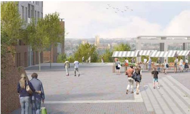
Mountfield Park, Canterbury. Proctor & Matthews Architects

To visually connect places in order to improve legibility and enhance local character and distinctiveness.