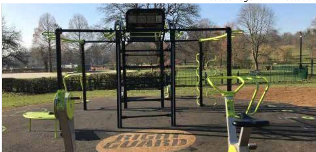
Gadebridge Park.

To ensure that trends relating to population and life expectancy are acknowledged in the planning and design of new communities, and that adequate provision is made for modern healthcare at the earliest possible point in the development.