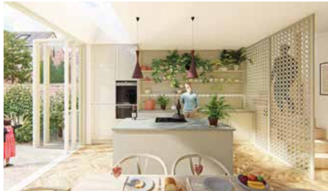
Terrace of the Future. HTA Design LLP

To maximise opportunities to bring sun and daylight into the homes, including the circulation space, to create a sense of spaciousness in all homes.